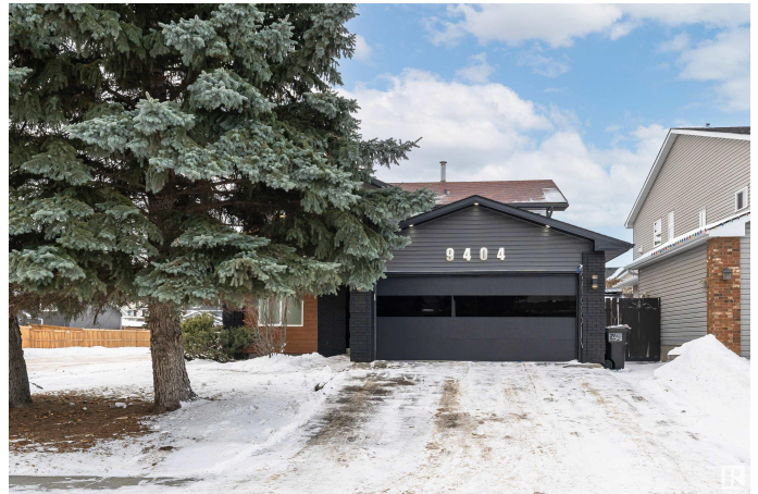
9404 173 St NW, Edmonton, AB

MLS® # E4421743 Price $635,000 Bedrooms 4