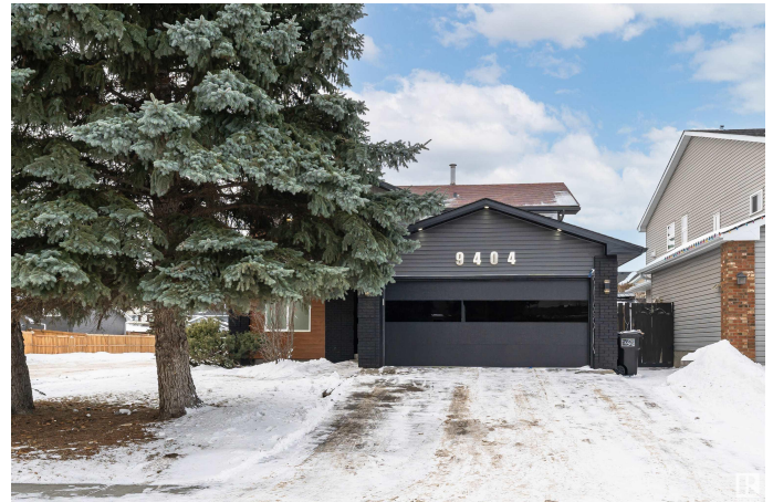
9404 173 St NW, Edmonton, AB

MLS® # E4421743 Price $635,000 Bedrooms 4